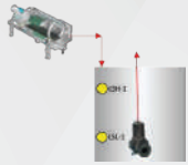
1. DRUM SCREEN