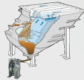
3. LAMELLA SETTLER